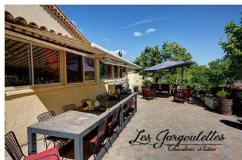
Days 1, 2 and 6:

Inn to Inn trips cannot guarantee the same level of comfort every night: one of the pleasures of a horseback riding trip is the variety ! We chose the accommodations for their location on the itinerary and for the quality of their welcome. With varying degrees of comfort, you will always have a memory: a good meal, a particularly pleasant atmosphere, or an exceptional setting. The price is not justified by luxury accommodation, but by the high logistical costs on an online horse riding trip.