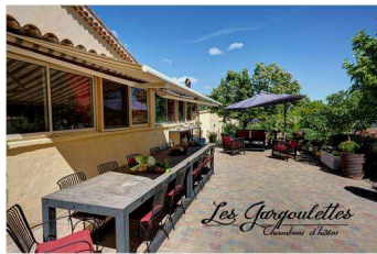
Days 1, 2 and 6:

Inn to Inn trips cannot guarantee the same level of comfort every night: one of the pleasures of a horseback riding trip is the variety ! We chose the accommodations for their location on the itinerary and for the quality of their welcome. With varying degrees of comfort, you will always have a memory: a good meal, a particularly pleasant atmosphere, or an exceptional setting. The price is not justified by luxury accommodation, but by the high logistical costs on an online horse riding trip.