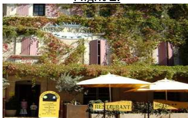
Auberge de Rustreou - Rustrel www.rustreou-hotel-apt.fr