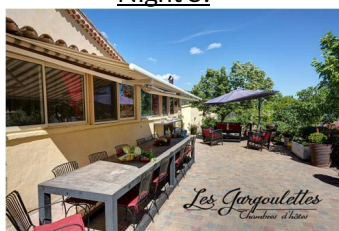
Les Gargoulettes - Lauris https://urlz.fr/hF6q