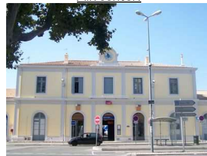
In front of the train station. Not the bus station.

The driver will have a "CAP RANDO" sign, and same sign on the back of our minibus: