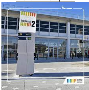
In front of terminal 2 Down the sign.