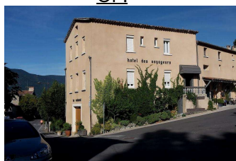
Hotel des Voyageurs - Montbrun-les-Bains https://urlz.fr/hF6C

* May be subject to modifications depending on availabilities.