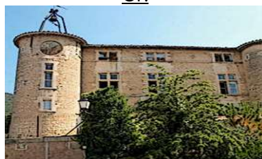
Le Chateau - Rustrel gitelechateau.pagesperso-orange.fr/