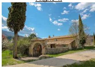
Le Mas des Reilhannette - Montbrun-les-Bains www.chambres-hotes-reilhanette.com/fr