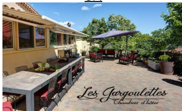
Les Gargoulettes - Lauris www.chambres-hotes-vacluse-gargoulettes.fr/