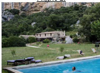
Les Seguins - Buoux www.aubergedeseguins.com/