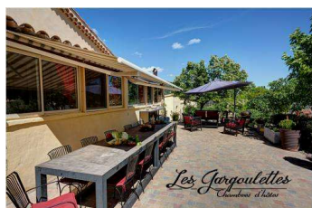
Days 1, 2 and 6:

Inn to Inn trips cannot guarantee the same level of comfort every night: one of the pleasures of a horseback riding trip is the variety ! We chose the accommodations for their location on the itinerary and for the quality of their welcome. With varying degrees of comfort, you will always have a memory: a good meal, a particularly pleasant atmosphere, or an exceptional setting. The price is not justified by luxury accommodation, but by the high logistical costs on an online horse riding trip.