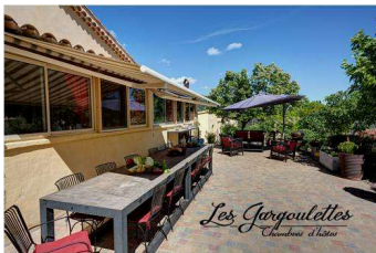
Days 1, 2 and 6:

Inn to Inn trips cannot guarantee the same level of comfort every night: one of the pleasures of a horseback riding trip is the variety ! We chose the accommodations for their location on the itinerary and for the quality of their welcome. With varying degrees of comfort, you will always have a memory: a good meal, a particularly pleasant atmosphere, or an exceptional setting. The price is not justified by luxury accommodation, but by the high logistical costs on an online horse riding trip.